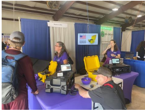
Some of the indoor vendors at Hamvention

The weather both days was very good, the rain showers held off until after the gates closed on Friday and had moved east by time the gates opened on Saturday. Ah the weather for Hamvention, it may be hot and sunny, it might be cold with snow flurries, or even a tornado warning. Given this fact if planning on attending having a "Plan B" just in case the weather doesn't cooperate. Fortunately, there are a lot of nearby attractions. The Air Force Museum https://www.nationalmuseum.af.mil/ free admission and one can spend an entire day exploring it. Another nearby attraction is the National Museum of the VOA https://voamuseum.org/ worth the price of admission plus they have a ham station for guest operation. There is also the American Packard Museum https://www.americaspackardmuseum.org/ Just a few of the nearby things to do in case of rain.