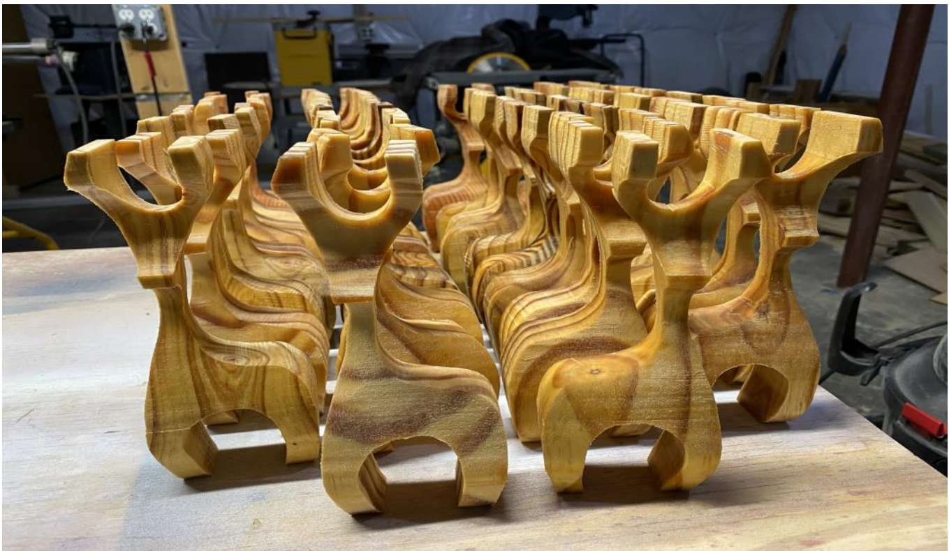
A herd of 42 reindeer hoping Santa will pick THEM for his sled