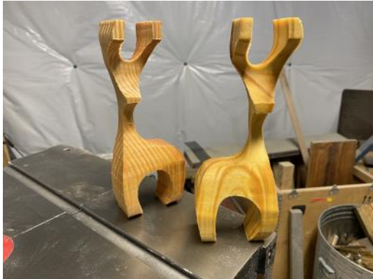
AWW ... how cute !!

Please write up a little article for me to publish in future I will be happy to do so.