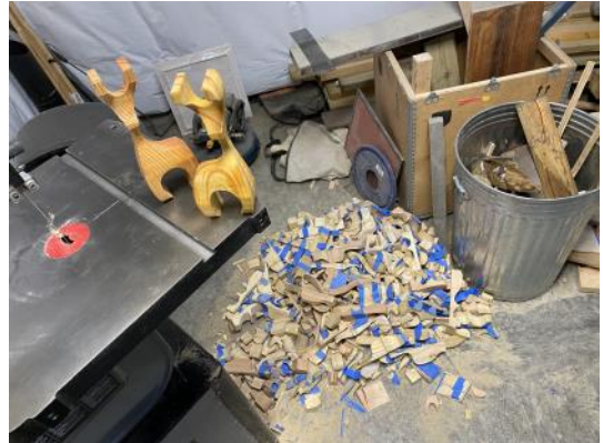
All the waste on the floor after making the herd !