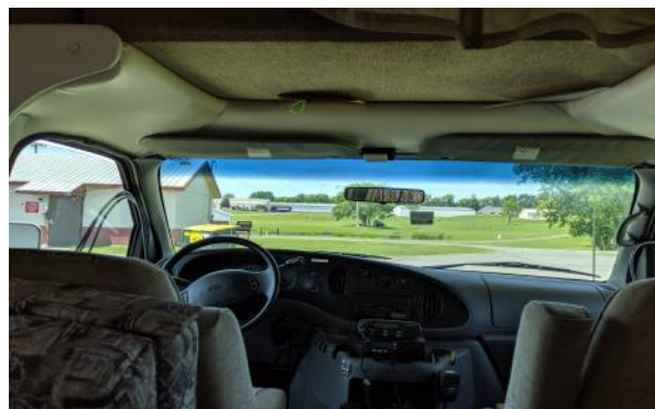
6 meter operating position inside NEMSTAR van. Good view of the pond and geese