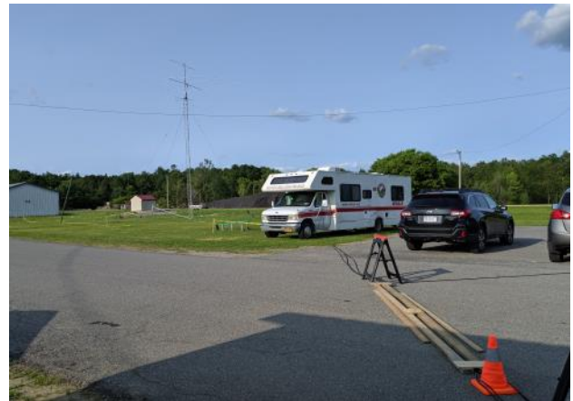
After they figured out the next steps.