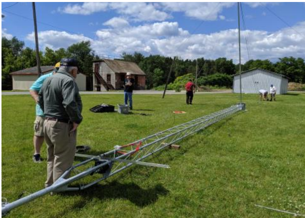
OK, What's the next step?