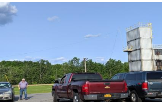
You can't see it but there is a dipole hanging from the fire tower.