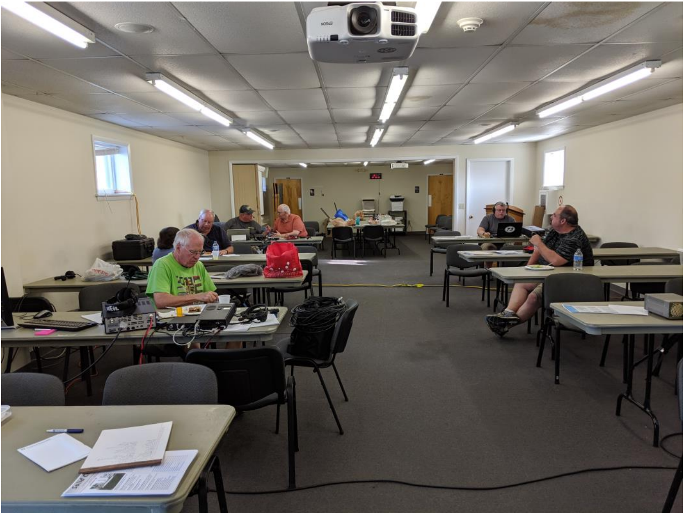
Inside the fire training classroom, the main operating positions. Three Stations and a GOTA station.