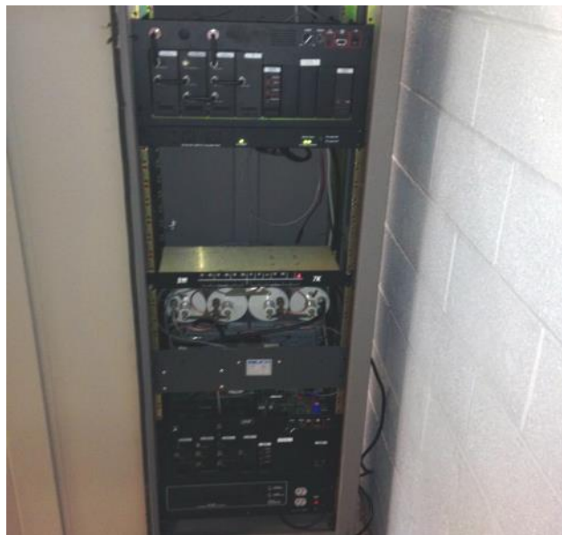
Above is the cabinet with the new 147.00 and 448.225 repeaters.

For the moment the 147.360 repeater will remain a Mastr II.