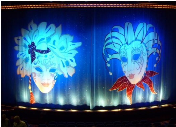
Theatre curtain on the cruise ship Norwegian Gem

June 7 — Tour de Cure (WB2NSC) June 27 and 28—Field Day Sept 12— Rosie's Walk Sept 12— CF Cycle for Life Sept 13 — SCARA HamFest (Ballston Spa) Oct 3—Apple Walk Oct 3—SET (Simulated Emergency Test) Oct 13—Tow Path Duathlon