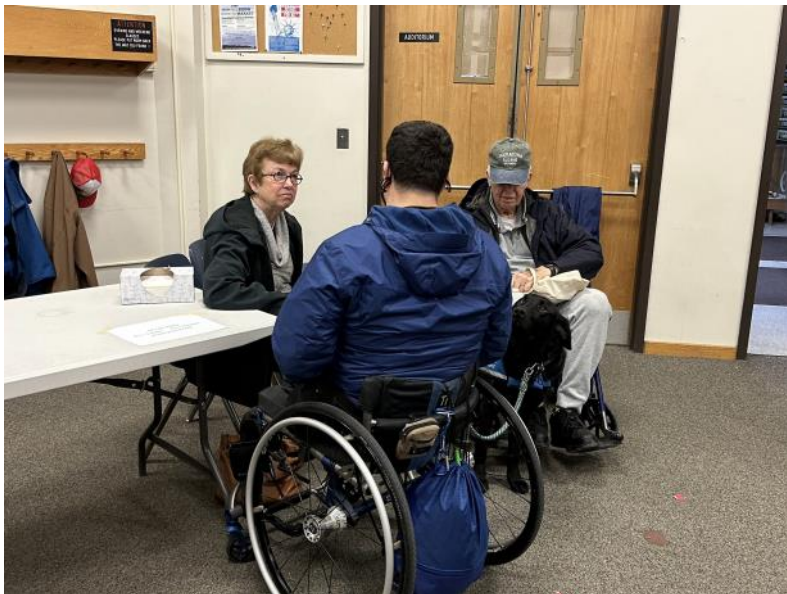
These folks found a quiet spot to chat

Our April Swapfest was a big success. It was a decent weather day, and people just wanted to come out and meet each other.