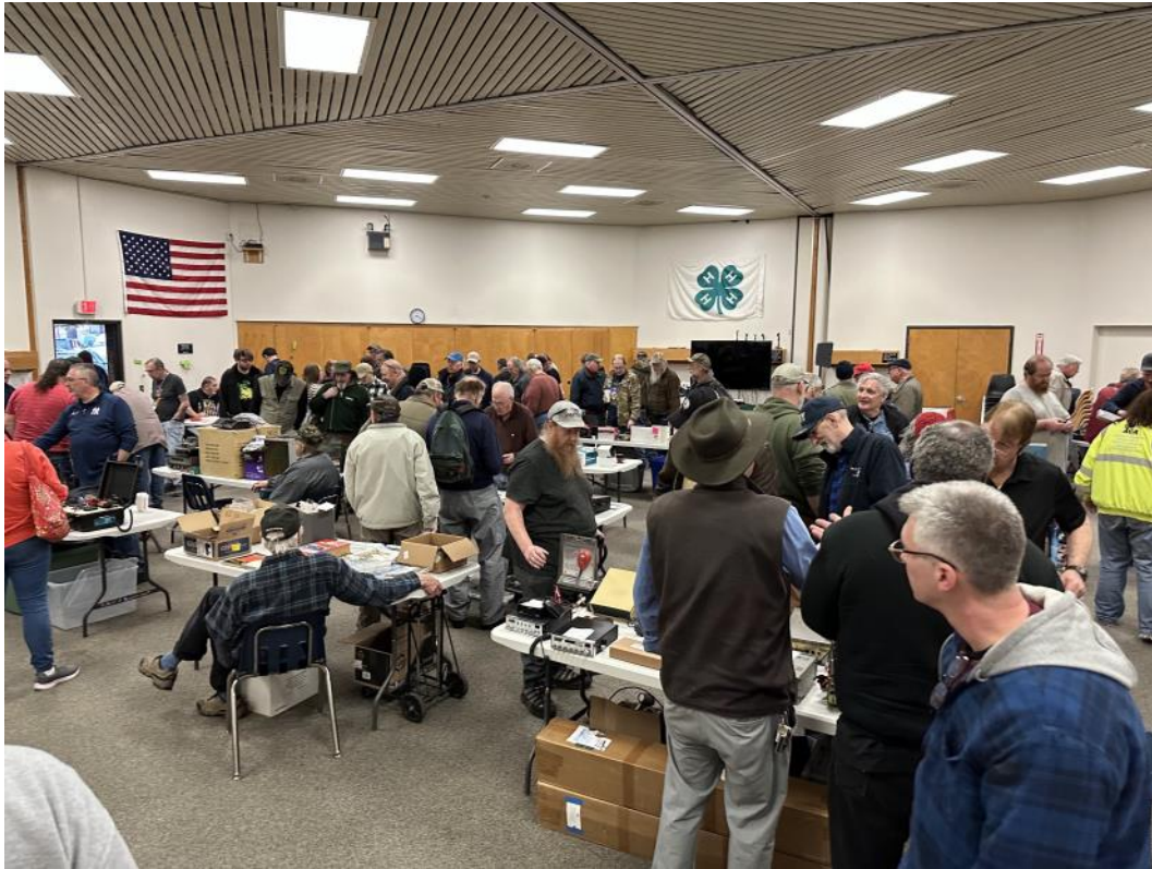
A good sized crowd showed up